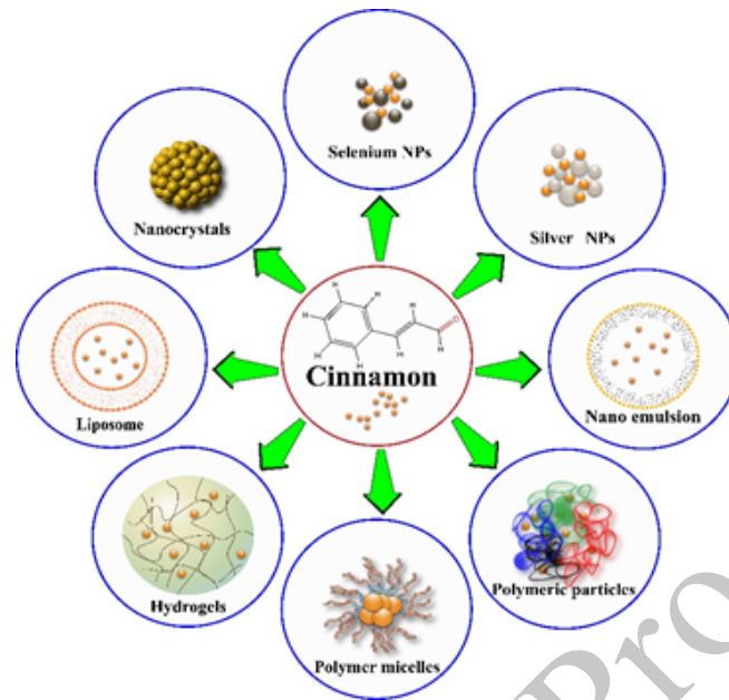
Fig. 1. Schematic representation of cinnamon's encapsulation within various nanocarriers for enhanced biomedical applications.

cholesterol while preserving HDL cholesterol, support its potential role in cardiovascular health [2, 26]. Emerging evidence suggests cinnamon's neuroprotective potential, with studies indicating its ability to inhibit the aggregation of tau proteins associated with neurodegenerative diseases such as Alzheimer's and Parkinson's. Furthermore, the spice has shown promise in cancer prevention through its potential to suppress tumor growth and angiogenesis [27]. Overall, the diverse bioactive compounds in cinnamon accessions support investigating their applications as natural compounds with multi-targeted mechanisms for improving human health.