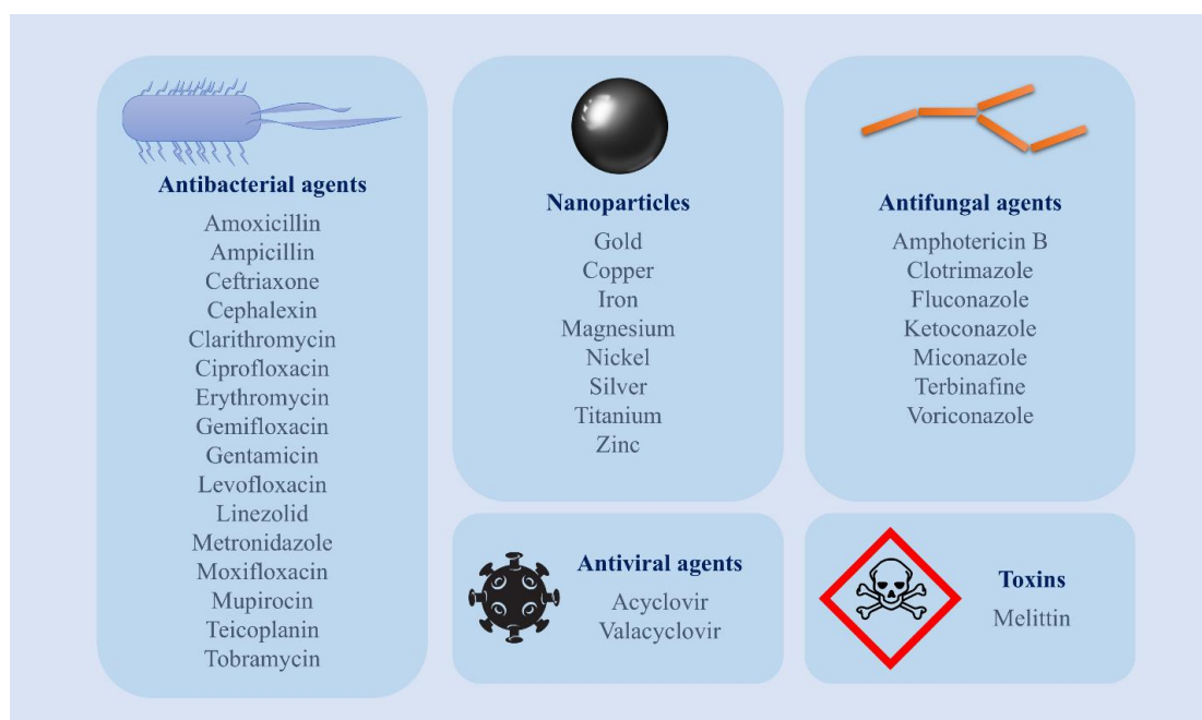
Fig. 2. Antimicrobial agents which can be delivered by chitosan-based nanocomposites and nanomaterials

Antibiotics are essential therapeutic agents that combat infectious diseases by inhibiting bacterial growth and replication. Their crucial role in modern medicine underscores their importance in effectively managing bacterial infections [36]. Based on their chemical and molecular structures, the major classes of antibiotics include \beta -lactams, macrolides, tetracyclines, quinolones, aminoglycosides, sulfonamides, glycopeptides, and oxazolidinones [37]. Unfortunately, the efficacy of these antibiotics has declined over time, posing serious health and economic challenges to society.