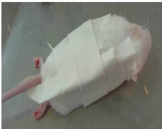
Figure 1. Male BALB/c mice after complete nanosilver coated dressings.

by using standard kits (Man Company and Pars Azmoon Company, respectively) in mice blood sera and were compared between two groups. All animal studies were conducted according to the US National Institute of Health guidelines (NIH publication no. 85-23, revised 1985).