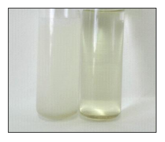
Fig. 2. The prepared nanoemulsions (right : nanoemulsions with NaCl 0.1) M and left: nanoemulsions with NaCl 0.5 M \,

The resulted emulsions have transparent and semitransparent appearance and the droplets size were in the range of nanoemulsions (Figure 2).